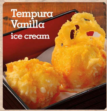
Tempura Vanilla ice cream