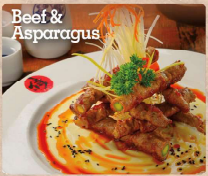
Beef & Asparagus