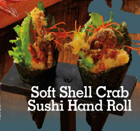
Soft Shell Crab Sushi Hand Roll